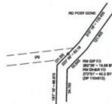
DIAG 2, 1:2000