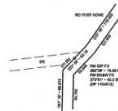
DIAG 2, 1:2000