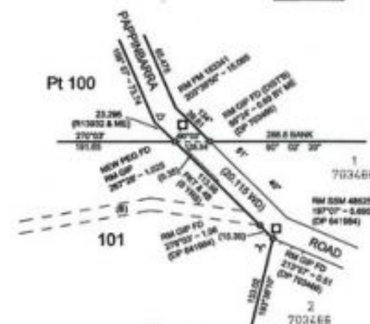
DIAG 3, 1:2000

(1) RESTRICTIONS ON THE USE OF LAND (DP703466)