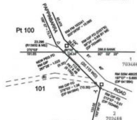
DIAG 3, 1:2000

(1) RESTRICTIONS ON THE USE OF LAND (DP703486)