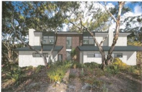
Proposed Residence Lot 12 DP255493 Birramal Drive Dunbogan Sketch Plans Artist Impression