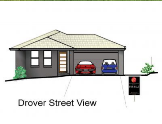
Drover Street View