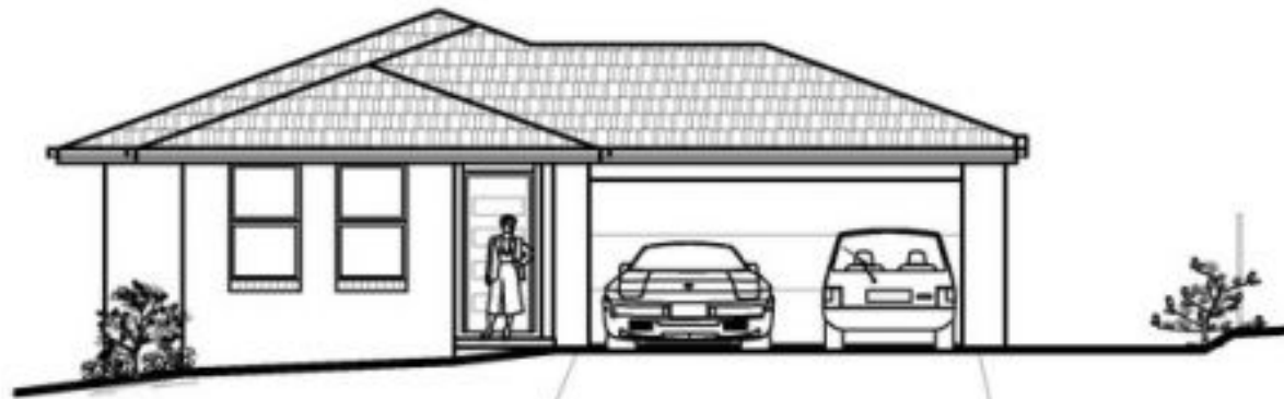
Drover Street View

LOT 419 CNR DROVER & BLACKSMITH STREETS, TIMBERTOWN ESTATE